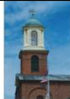
St. John's Episcopal Church Portsmouth, New Hampshire 2007 Member Directory

More information regarding scheduling to come.