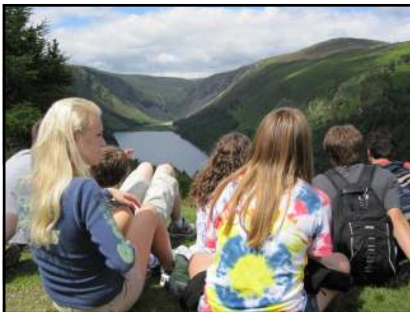
Glendalough, overlooking the Upper Lake

For me, the most inspiring aspect of this experience was that the people of St. John's supported these teenagers with such abundance and unwavering love at every stage of the process. Beginning with planning the journey, then with the Soiree and further fundraising, then with prayers of support, and finally with excitement upon hearing about the trip, this community has shown that it cares, and that it was a part of this process.